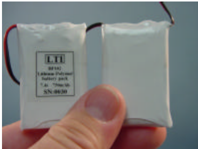
Fig 5 – LTI BP102S Split-cell Li-Polymer Built-in Battery