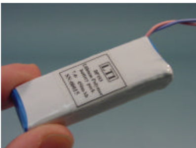
Fig 6 – LTI BP103S Li-Polymer Built-in Battery