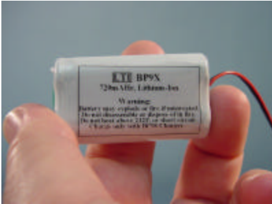
Fig 3 – LTI BP98S Standard Li-ion Built-in Battery