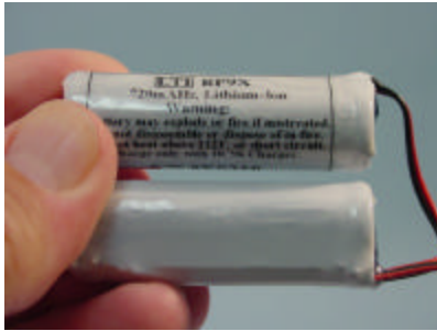
Fig 2 – LTI BP88S Split-cell Li-ion Built-in Battery